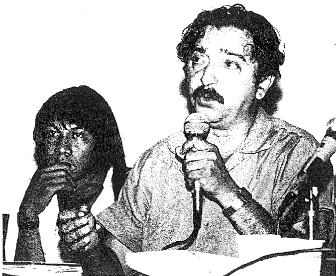
Chico Mendes worked to forge an Alliance of the Peoples of the Amazon.